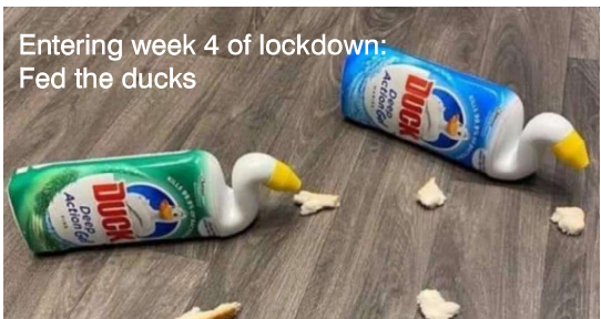
Entering week 4 of lockdown: Fed the ducks

Thirty days hath September, April, June, and November, all the rest have thirty-one Except March which has 8000